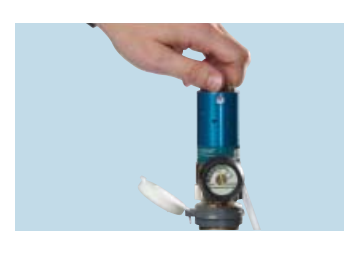
5.3 Allow the regulator to vent to atmosphere by selecting a flow on the system. Remove the regulator when the contents gauge reads zero.