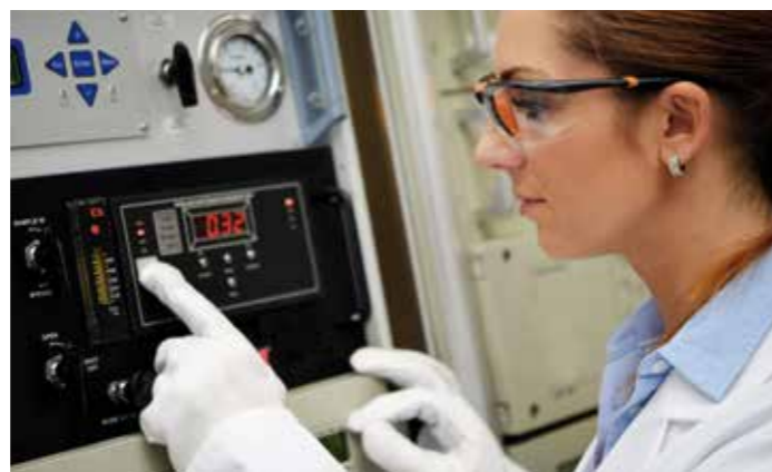
Specialised personal protective equipment