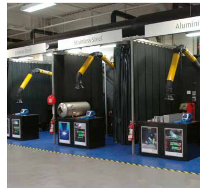
BOC's Manufacturing Technology Centre, Wolverhampton