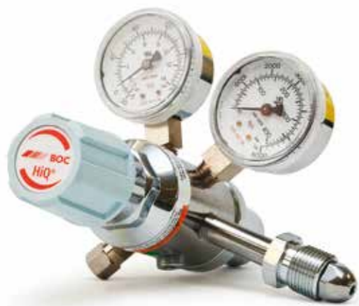
High purity regulator for "Laserpure" gases