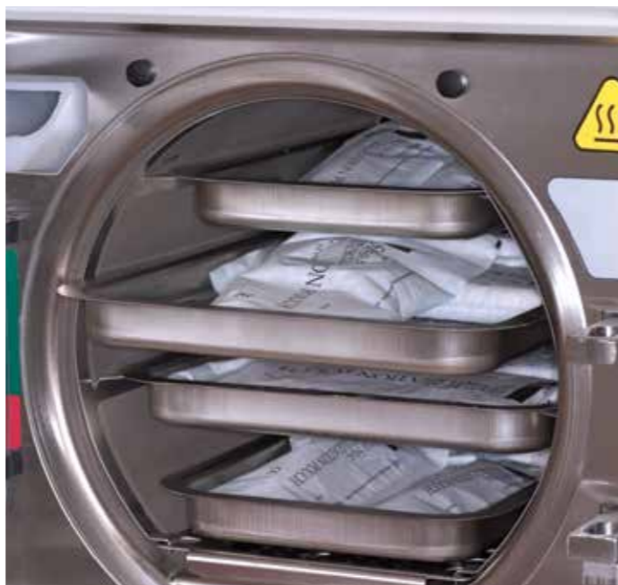
Ethylene Oxide sterilisation

BOC can supply pure ethylene oxide as well as a range of EO CO 2 blends.