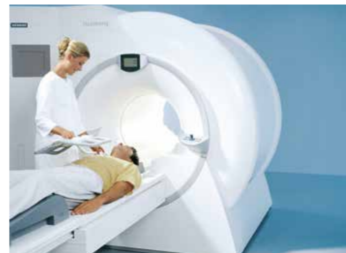
Medical diagnostic apparatus

Working in partnership with manufacturers in the medical sector, BOC strives to add value to your manufacturing processes and deliver a flexible and innovative service provision to support your unique business needs with an extensive range of supply solutions