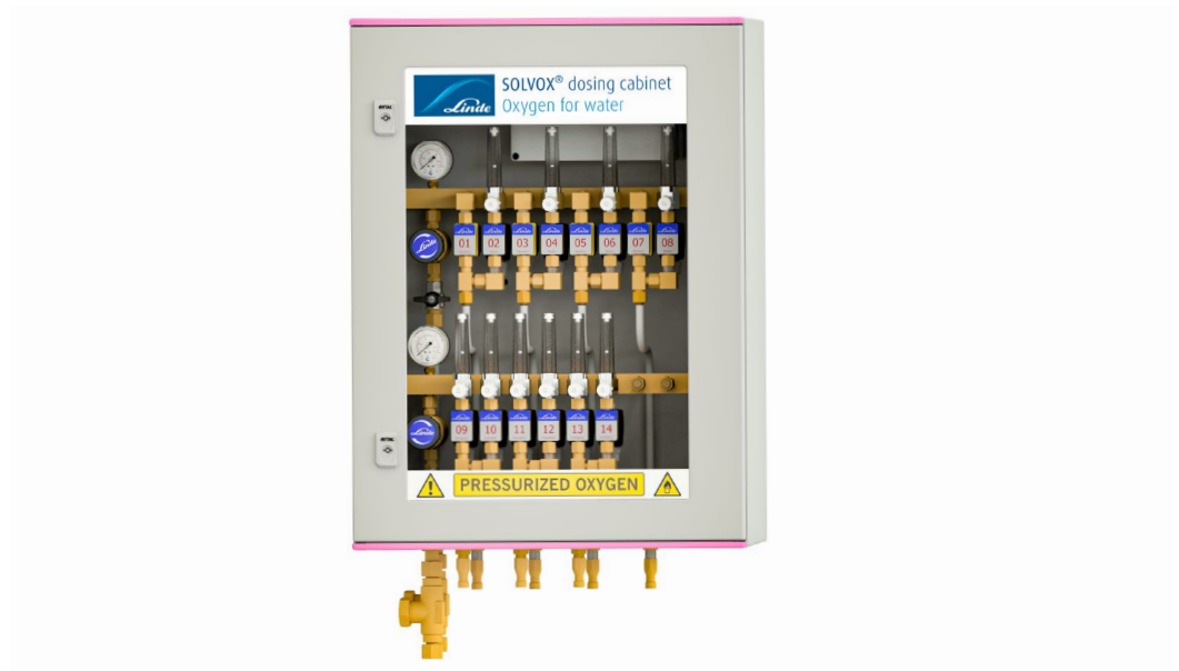
Example of SOLVOX dosing cabinet

Introduction SOLVOX dosing cabinet is a series of tailor-made oxygen dosing cabinets. Available in configurations for operational oxygenation, emergency oxygenation or both, these dosing cabinets support standard system integration.